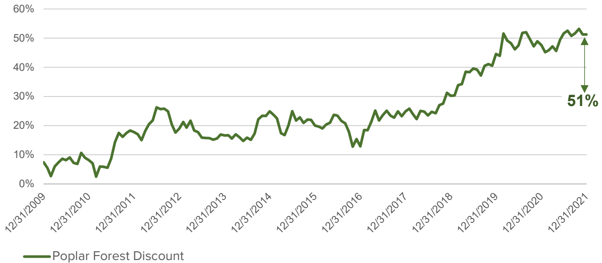
Poplar Forest P/E Discount To S&P 500